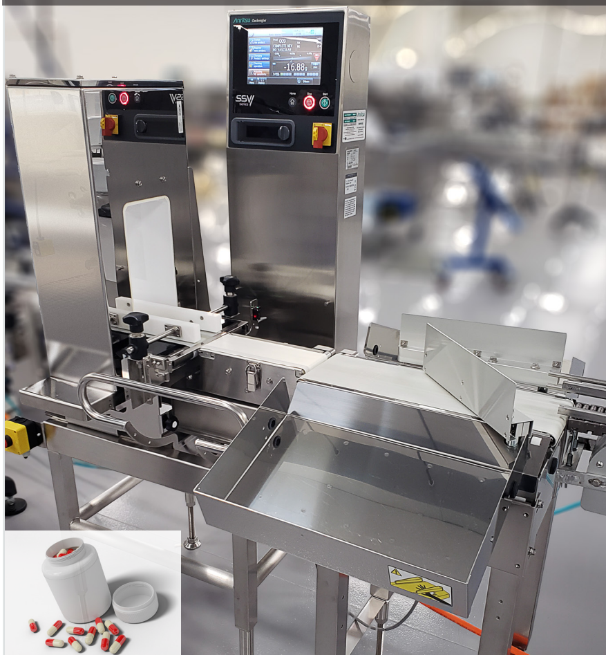
Example installation with vertical metal detector and dual flipper reject